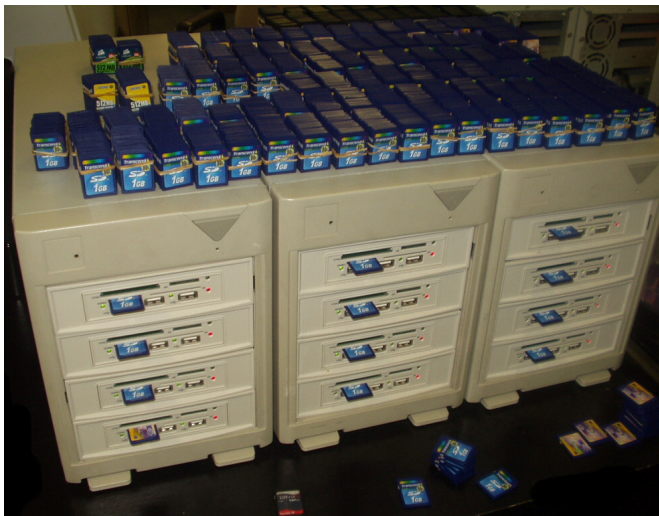
One of CD-ROM Services X Card duplicators

Web Sites: www.cdroms.com.au www.discdupe.org .